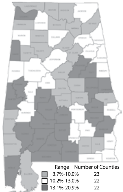
Births to Unmarried Teens