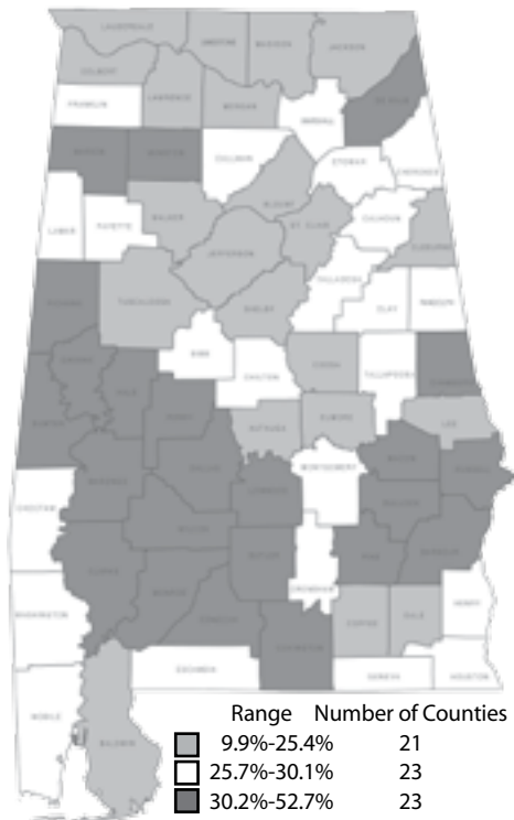
Children in Poverty

Higher percentages are better on this indicator